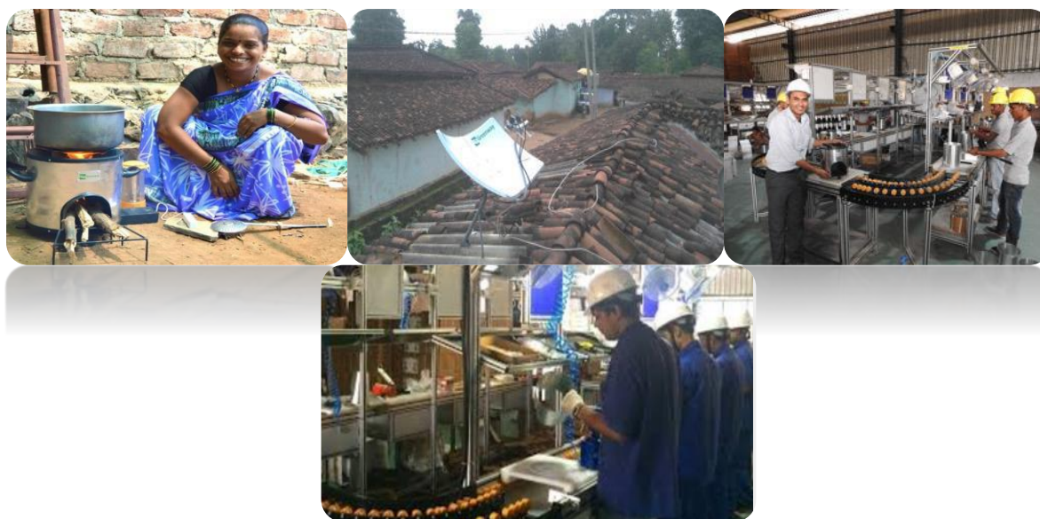
Greenway Vadodara Facility

To create a stove that would solve the fundamental needs of the people, 10 different prototypes were tested in five pre-identified states wherein local women were approached for feedback. All the concerns were carefully analysed and incorporated into the final product.