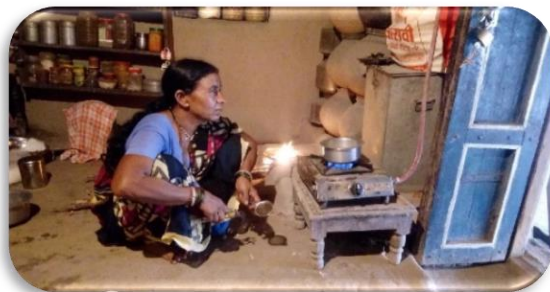
Figure b) Smoke free and self-reliant cooking energy with Vaayu