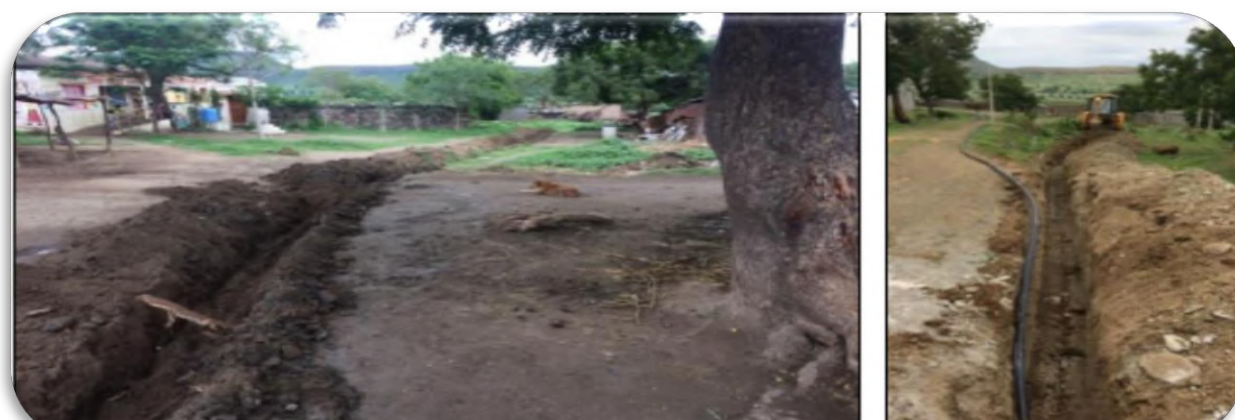
Excavation for laying a biogas grid