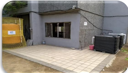
Figure d) 22.5 kg per day installation at BMCC college hostel in Pune.