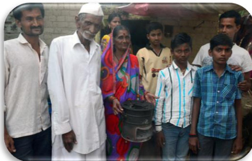
A rural family with their Envirofit SPANDAN efficient cookstove.