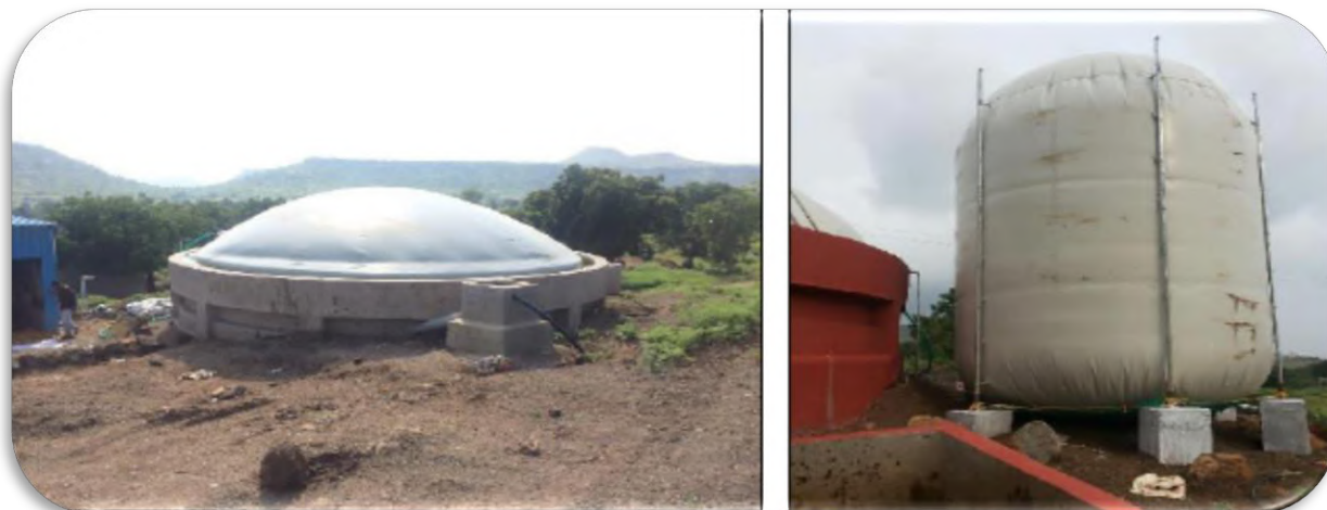
Construction of biogas digester and erection of biogas plant