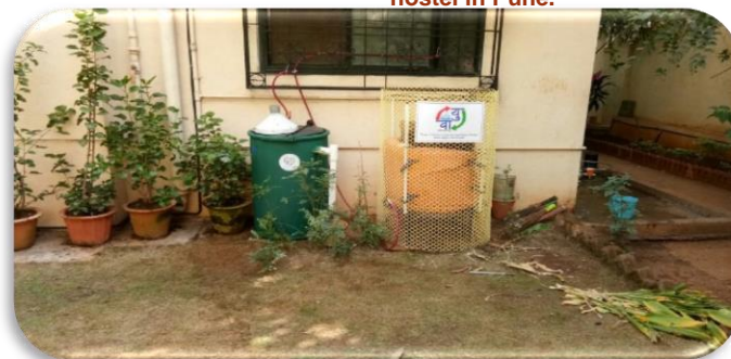
Figure e) Vaayu in the garden