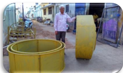
Half of the mould

A conventional biogas plant, such as Deenbandhu , requires a fixed underground digester chamber, made with layers of bricks. An additional layer of cement mortar (with sand) forms the roof above. The construction of this chamber and the roof requires high level of skill and takes about 8 weeks to