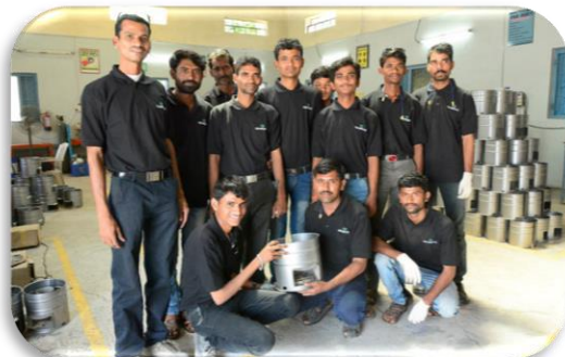
Workers in Aurangabad pose with an almost complete SPANDAN efficient cookstove.