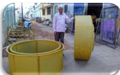
Initial arrangement of the mould