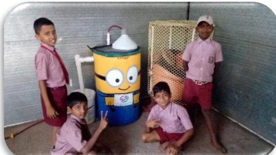
Figure c) 4th standard kids operate Vaayu in the garden