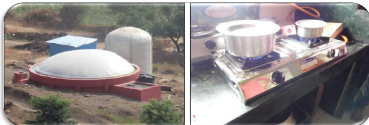
Complete installation of biogas at Dhopteshwarwadi