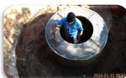
Placing of FRP Drum