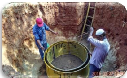
Fixing of weld mesh in the mould