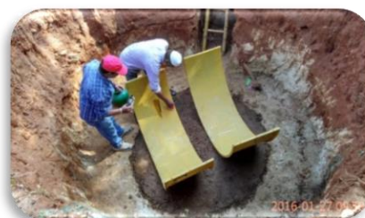
Oiling the surface of the mould