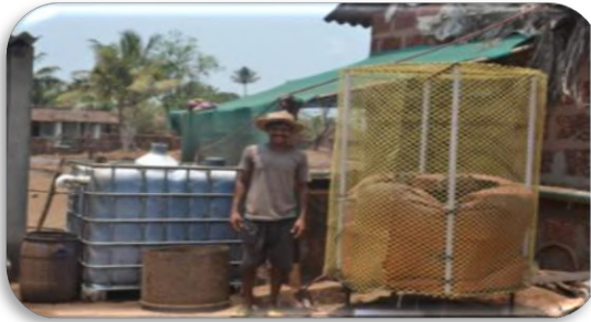
Figure a) Villager in Ratnagiri district of Maharashtra with his Vaayu

Vaayu Mitra is a community of people who use Vaayu and are generating it from their waste.