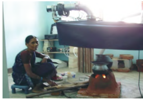
PEMS hood in use