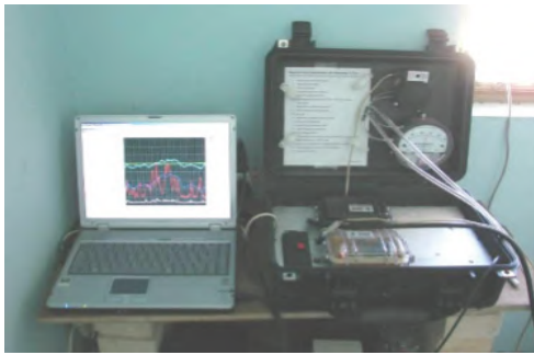
PEMS sensor box and computer