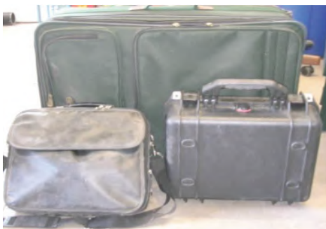
PEMS sensor box, laptop and hood in cases